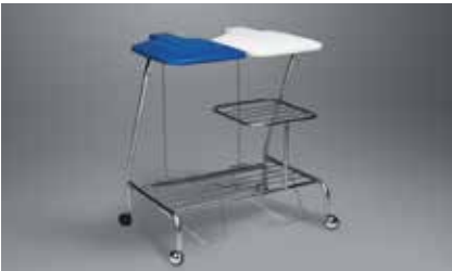
Double Linen Skip AX300