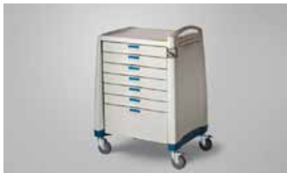
Medication Carts AVAL12041-9