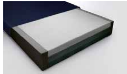
Iona 3 Core Foam Mattresses PC150