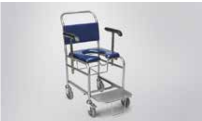
GM Shower/Commode Chair AX432