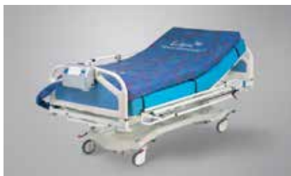
Air Mattress PA 5550M/74M | PA 550M