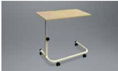
Overbed Tables IONA-COBTWW