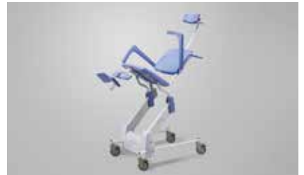
Lopital Reflex Shower Chair LOPI51005600