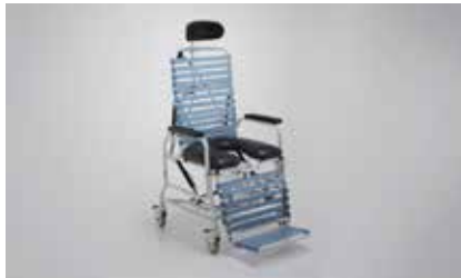
Broda Tilt Shower Chair BRODACS385