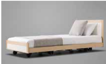
Stralus Beds S Line / S Line Low