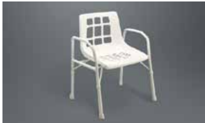
Plastic Shower Chair PCPR5300U