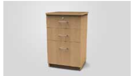
Bed Side Lockers KL3- Various Configurations