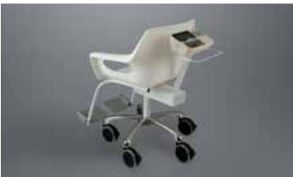
Digital Weighing Chair AISHVL-CS