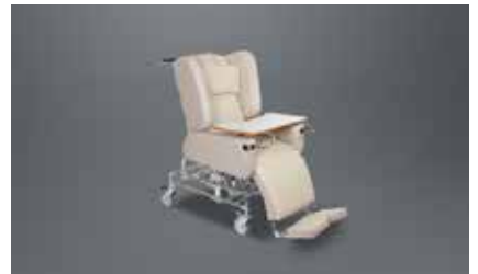
Daily Chair ACHHAC59113